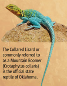
The Collared Lizard or commonly referred to as a Mountain Boomer ( Crotaphytus collaris ) is the official state reptile of Oklahoma.