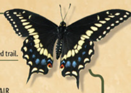
The Black Swallowtail ( Papilio polyxenes ) is the official state butterfly of Oklahoma.