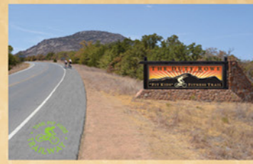
The Scenic Byway includes the towns of Medicine Park, Apache, Carnegie, Mountain View, Meers and the Wildlife Refuge.