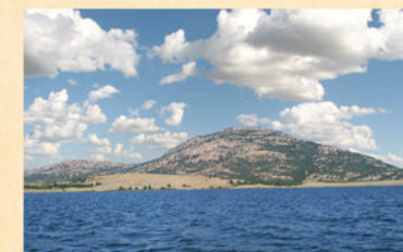
LETRA/Lake Elmer Thomas Recreation Area offers fishing, hiking, biking, camping, swimming, miniature golf, water slide, archery, rental cabins and RV campgrounds.