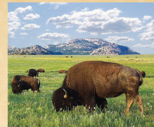
The Wichita Mountains Wildlife Refuge offers over 15 miles of hiking trails from novice to intermediate levels. What better way to get exercise than in the beautiful surroundings of the Wichitas.